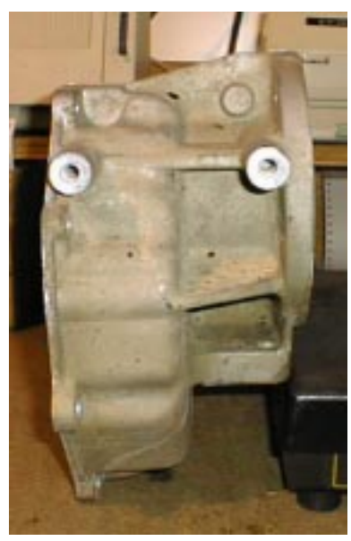
Stock Dodge Adapter