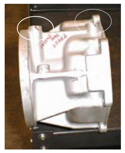
Cut off the stock Dodge shifter bosses

Hardware for the "T" style shifter has not been supplied due to the various different styles of aftermarket shift handles available.