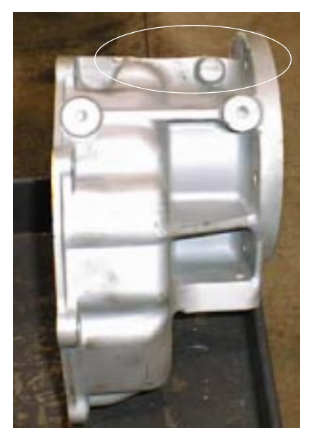
Modified to fit the transfer case shifter linkage