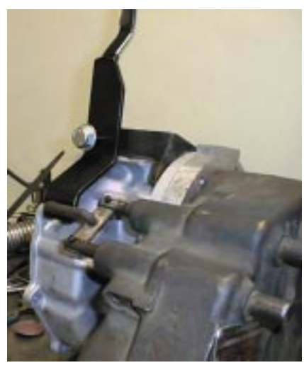
"T" handle linkage installed